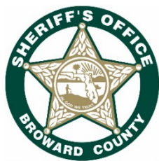
Sheriff Scott Israel