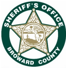
Sheriff Scott Israel