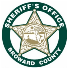
Sheriff Scott Israel