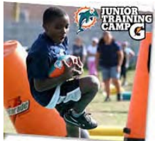
Miami Dolphins/Gatorade JUNIOR TRAINING CAMP