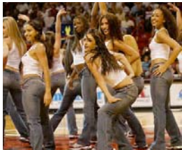
THE MIAMI HEAT DANCERS