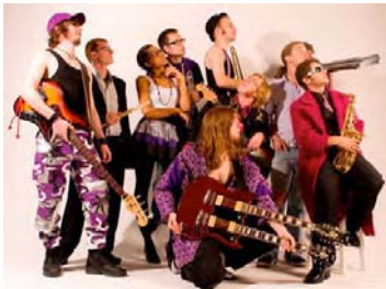
THE FIRST STREET HEAT Funk, Hip Hop, Pop & Soul all rolled into one fun band from Ohio!