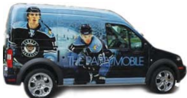
Florida Panthers PlayStation 3 NHL 2010 PARTY MOBILE