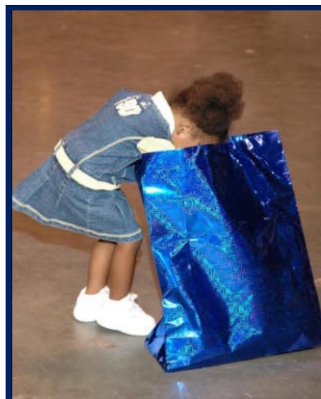
A little girl digs through the bag of goodies she received at a Christmas In July event

The number of children helped by Christmas In July has grown annually. Since its inception in 2002, Christmas In July has served more than 6,000 children in Broward County.