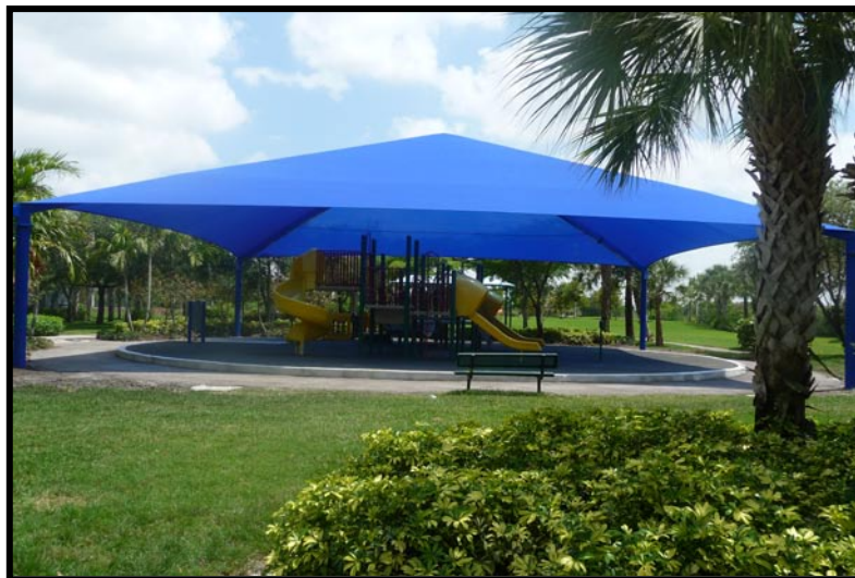
New Shade Cover at Emerald Estates Park

The play surface at Windmill Ranch park has been upgraded to the poured in place rubber surfacing found in other parks. Parents are reminded that even with the shade covers the playground surfaces can get hot so proper footwear should be worn at all times.