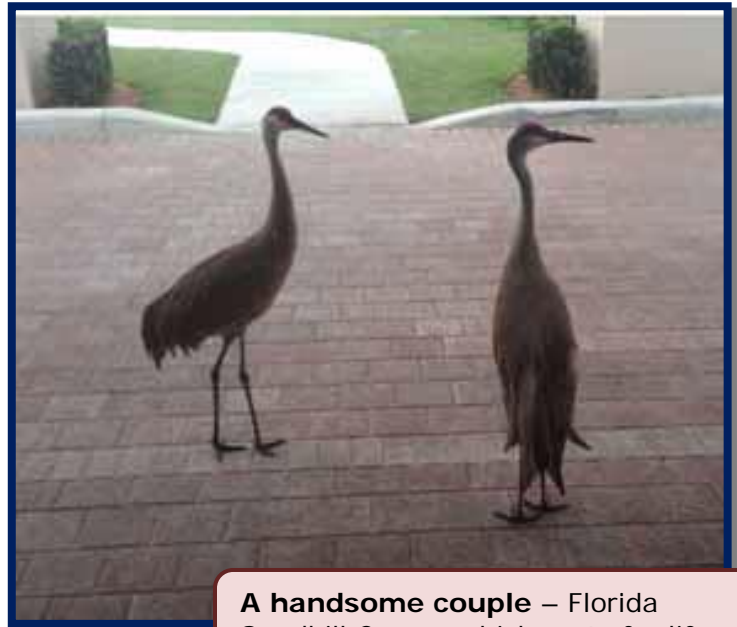
A handsome couple – Florida Sandhill Cranes which mate for life.

Because they mate for life they can be a bit protective. During mating season they can be aggressive if they perceive a threat of someone moving in on their mate.