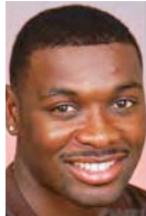
Former Miami Dolphin & Fitness Expert TERRY KIRBY