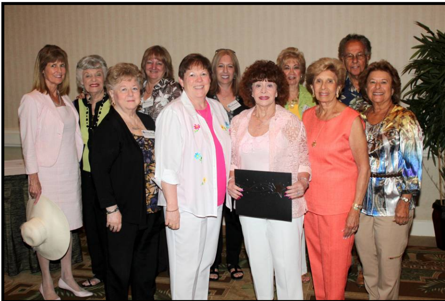
The Weston Friends of the Library at the annual Broward County Friends of the Library Awards Luncheon:

Several large Book Fairs are also held every year. The money they raise is used to provide special library events for children of all ages and items needed by the library.