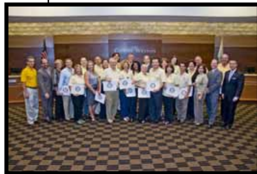
Rotary Club of Weston CERT graduates

If a disaster happens that overwhelms local response capability, CERT members can apply their training to give critical support to their family, loved ones, neighbors or associates in their immediate area until help arrives. CERT members can also assist with non-emergency projects that improve the safety of the community.