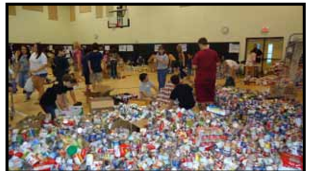
Sorting day at Western High School!

Juice Pancake Mix Cereal/Oatmeal Rice Pasta Cookies Jelly Peanut Butter Stuffing Napkins Aluminum Foil Shampoo Dish Soap Laundry Detergent Canned meats Toothpaste Soap/Body Wash Canned Vegetables Canned Fruit Canned Cranberries Canned Sweet Potatoes Canned Gravy