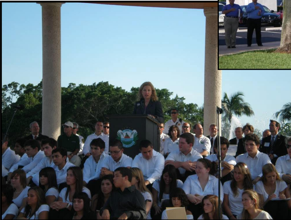
Left: Congresswoman Debbie Wasserman Schultz