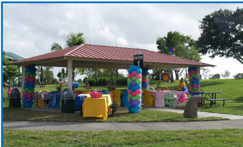
Photo of a shelter the renter decorated for a party

To check for shelter availability or for more details, please call the Community Services office at 954-389-4321 or stop by the Community Center.