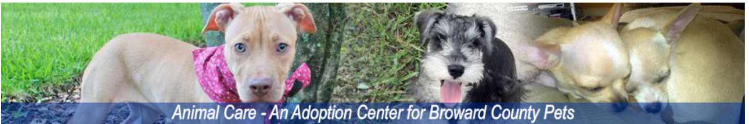
Animal Care - An Adoption Center for Broward County Pets

Broward County Animal Care will host the shelter's very first "Pick Your Own Price" adoption promotion on Black Friday, November 23th, from 11 a.m. to 4 p.m. at the Fort Lauderdale Adoption Center, 1870 S.W. 39 Street, Ft. Lauderdale. The special "kennel buster" event will allow adopters to pay any amount they choose for their new pet — from adult dogs and cats, to younger kittens and puppies.