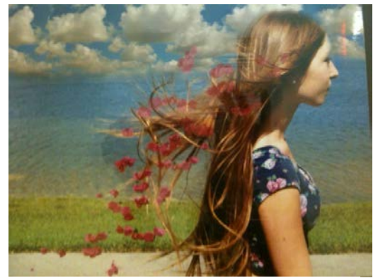
Cypress Bay High School's Photography Club - "Girl"