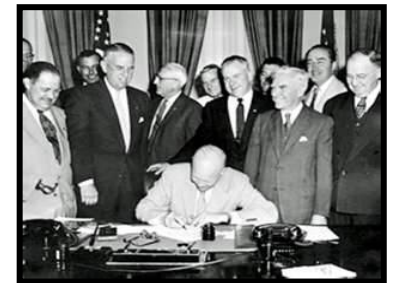
President Eisenhower signs HR7786, officially changing Armistice Day to Veterans Day.

November 11, or what has come to be known as Veterans Day, was originally set as a U.S. legal holiday to honor Armistice Day- the end of World War I, which officially took place on November 11, 1918. In legislature that was passed in 1938, November 11 was “dedicated to the cause of world peace and to be hereafter celebrated and known as ‘Armistice Day.’” As such, this new legal holiday honored World War I veterans.