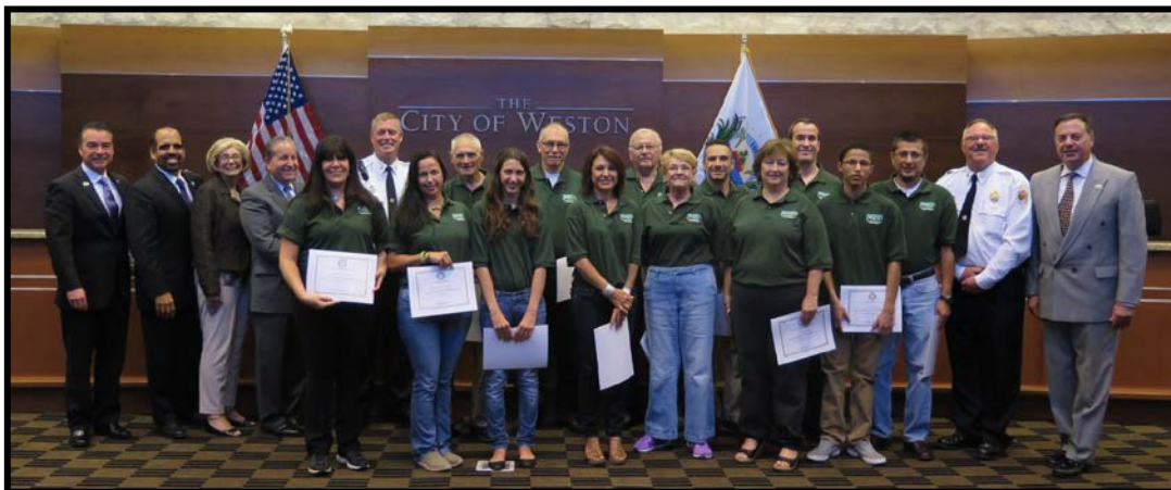
Most recent graduating class, April 2014