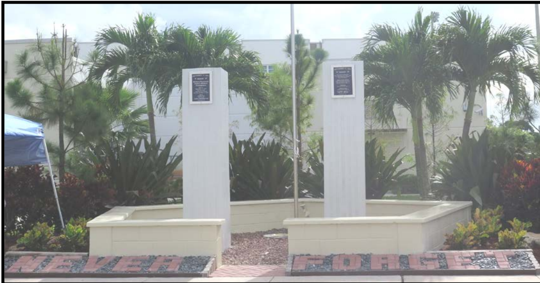
Student Constructed 9/11 Memorial

Each school year after the tragic events of 9/11, students at Western High School have come together to pay respect to the thousands who lost their lives on September 11, 2001.