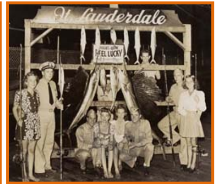
Ft. Lauderdale Dock

Broward County has gone through multiple milestones that have developed the county and flourished the destination for not only a burgeoning tourism industry but also for top national companies and small businesses that continue to expand with the healthy growth and reputation of Broward County.