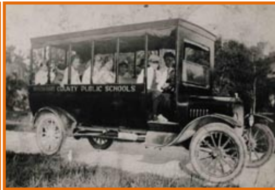
First Broward County School Bus