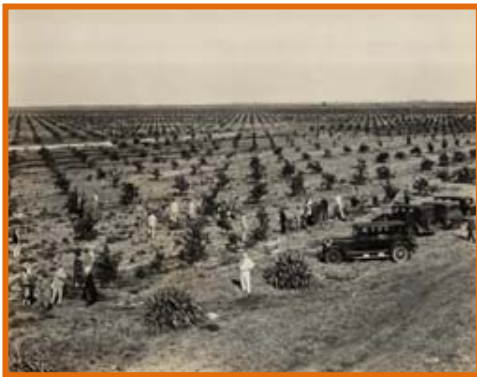
Flamingo Grove in Davie

In the century to follow, Broward County would become a top destination for national and international travelers, while attracting a diversity of residents that would shape the vibrant arts and culture reputation that make the County unique to this day.