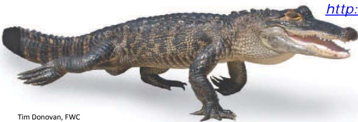
Tim Donovan, FWC

http://myfwc.com/conservation/you-conserve/wildlife/gators/