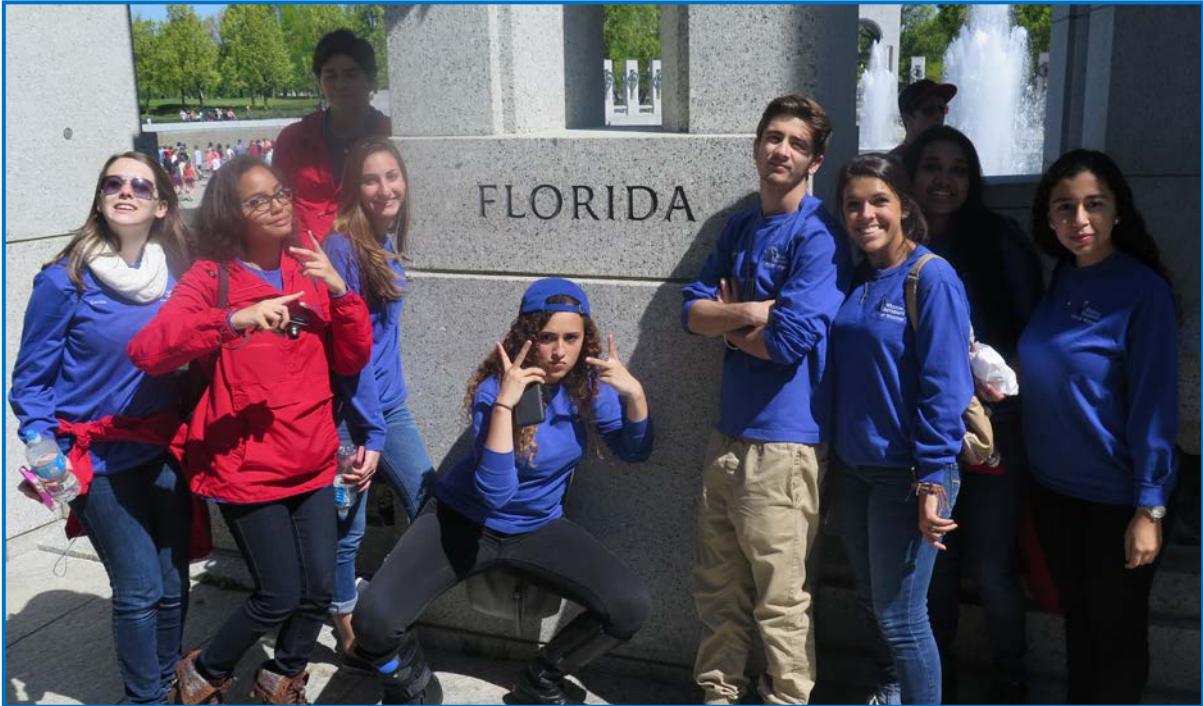
Showing our (silly) state spirit at the World War II Memorial