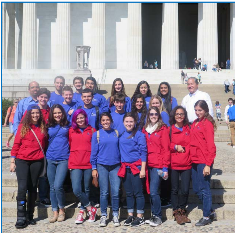
First stop – Lincoln Memorial