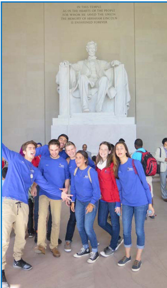
And all smiles at the Lincoln Memorial