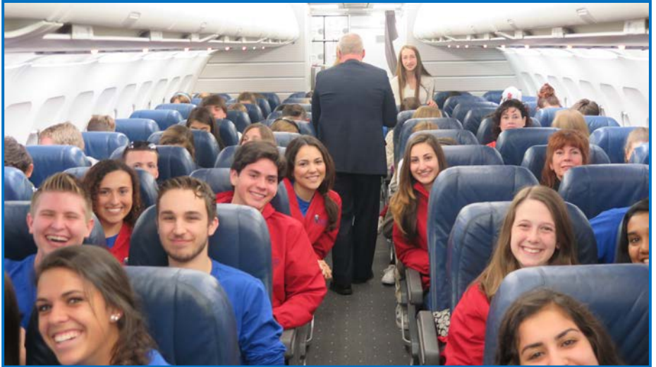
All smiles at 7:00 a.m.