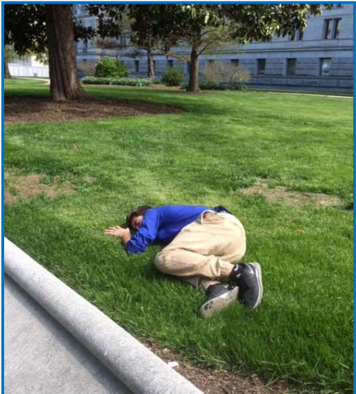
And then finally, nap time!