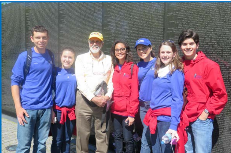
Spending time with a Veteran at the Vietnam Memorial