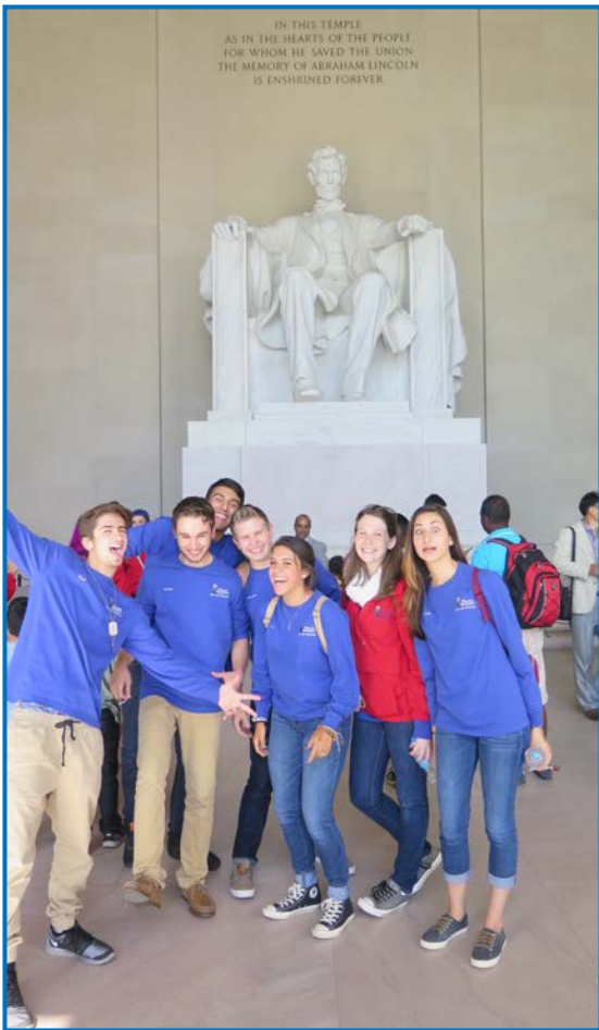
And all smiles at the Lincoln Memorial