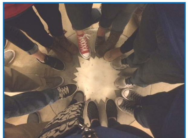
Great looking feet at the epi-center of Washington DC!