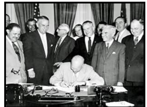
President Eisenhower signs HR7786, officially changing Armistice Day to Veterans Day.