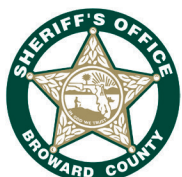
Sheriff Scott Israel

The City of Weston helps to fund School Resource Deputies at Cypress Bay High School, Tequesta Trace and Falcon Cove Middle Schools and two deputies shared among the public elementary schools within the City.