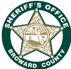
Sheriff Scott Israel