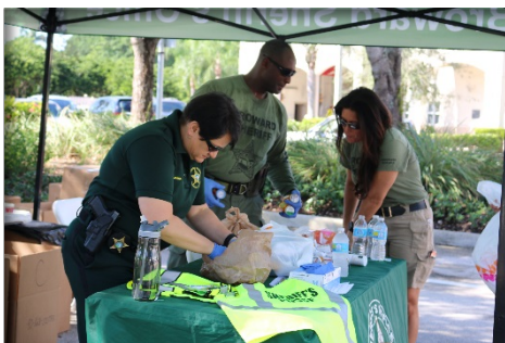
BSO Deputies sort through and dispose of unwanted prescription medications.