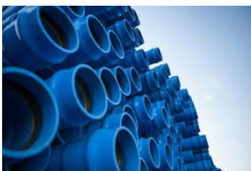
Water and Sewer System Upgrades