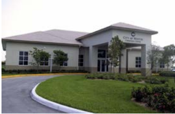
Community Center Improvements