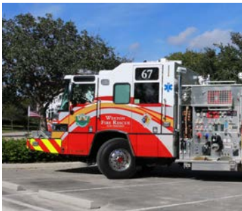
New Fire Station in Bonaventure