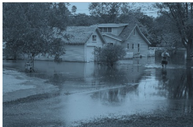
Programa Nacional de Seguro Contra Inundación Resumen de Cobertura