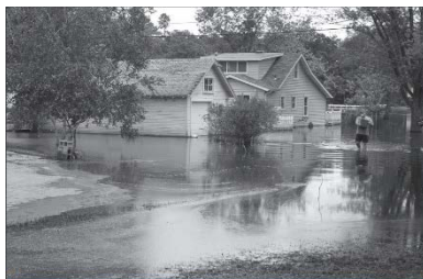
National Flood Insurance Program Summary of Coverage