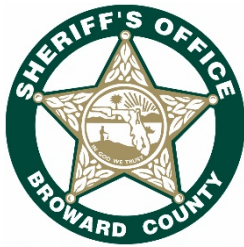
Sheriff Scott Israel