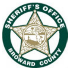
Sheriff Scott Israel