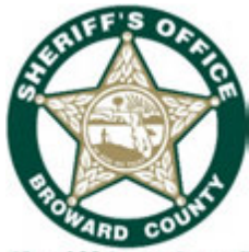
Sheriff Scott Israel