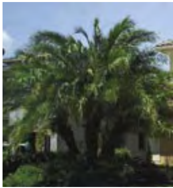
Senegal Date Phoenix reclinata