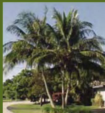
Coconut Cocos nucifera (many varieties)