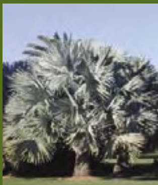
Bismarck Bismarckia nobilis