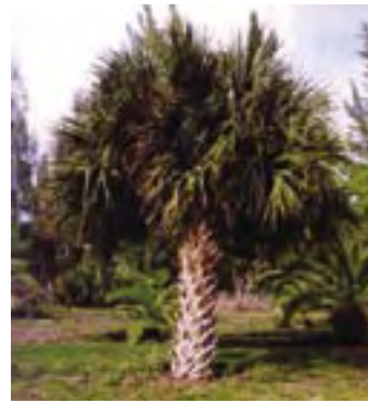
Sabal Sabal palmetto