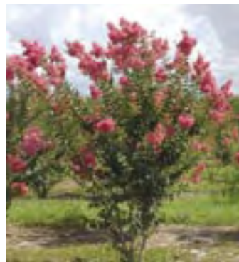
Crape Myrtle Lagerstroemia indica