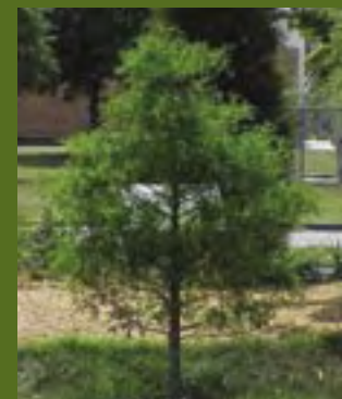
Cypress Taxodium distichum