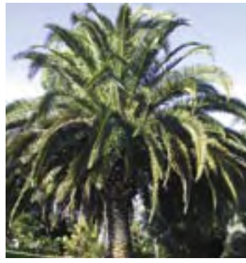
Canary Island Date Phoenix canariensis