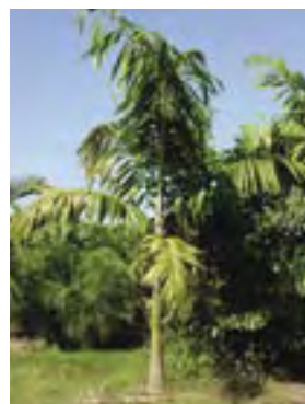
Winin Veitchia winin