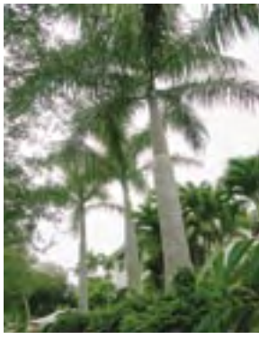
Florida Royal/Royal Roystonea Regia.