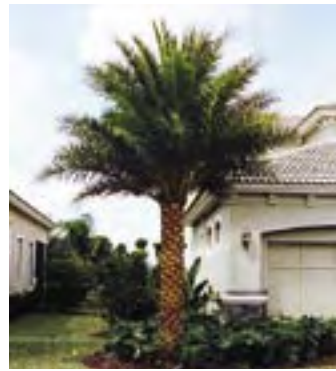
Sylvester Phoenix sylvestris