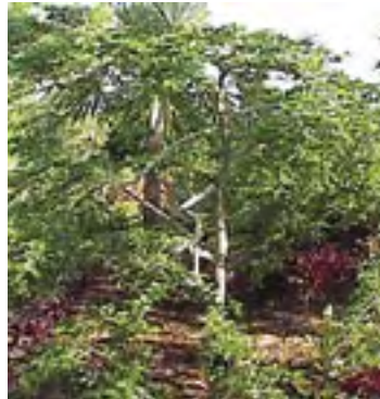
Lignum-vitae Guaiacum sanctum