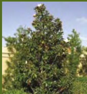
Magnolia "Little Gem" Magnolia grandiflora 'Little Gem'