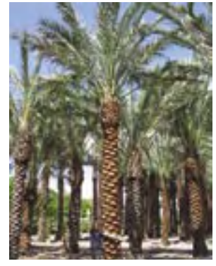
Date Phoenix dactylifera