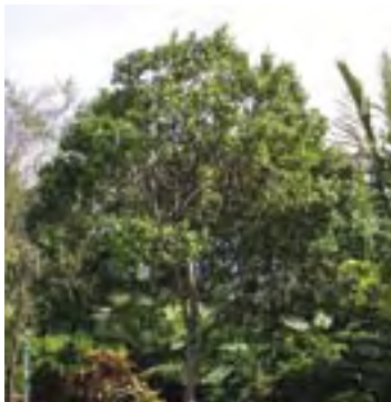
Black Ironwood Krugiodendron ferreum