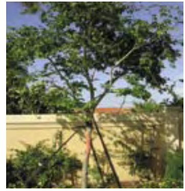
Verawood Bulnesia arborea