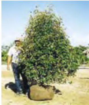
Jamaican Caper Capparis cynophallophora