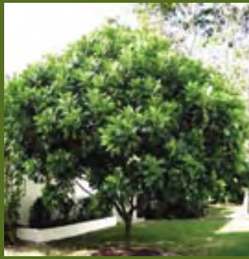
Japanese Fern Tree Filicium decipiens