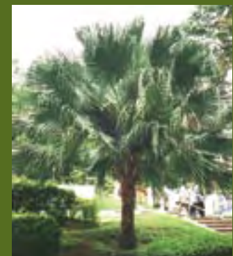
Chinese Fan Livistona chinensis