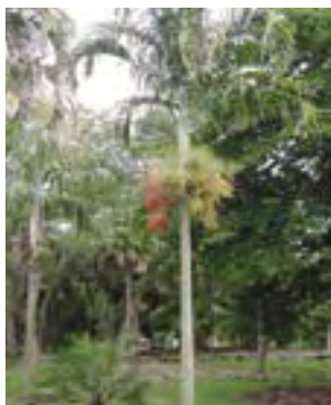
Montgomery Veitchia montgomeryana