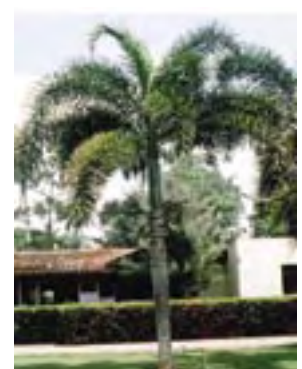
Foxtail Wodyetia bifurcata