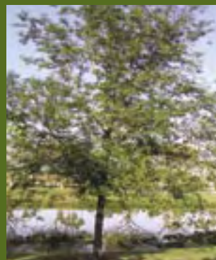
Indian Tamarind Tamarindus indica