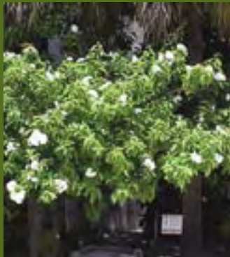
White Geiger Cordia boissieri