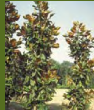
Magnolia "Blanchard" Magnolia grandiflora 'Blanchard'