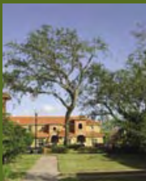
Live Oak Quercus virginiana