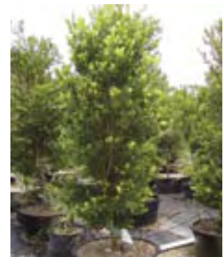
Simpson Stopper Myrcianthes fragrans