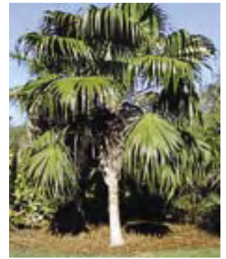
Florida & Keys Thatch Thrinax sp.