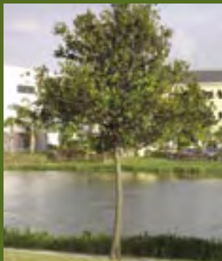
Beautyleaf Calophyllum brasiliense