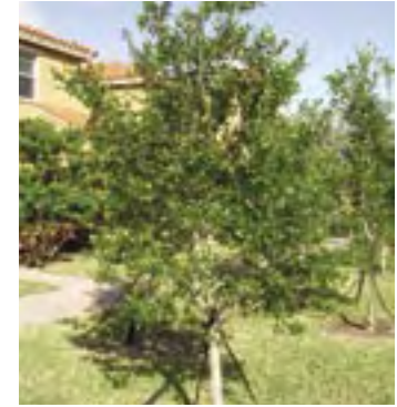
East Palatka Holly Ilex x attenuata 'East Palatka'