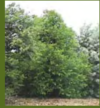
Willow Busic Sideroxylon salicifolium