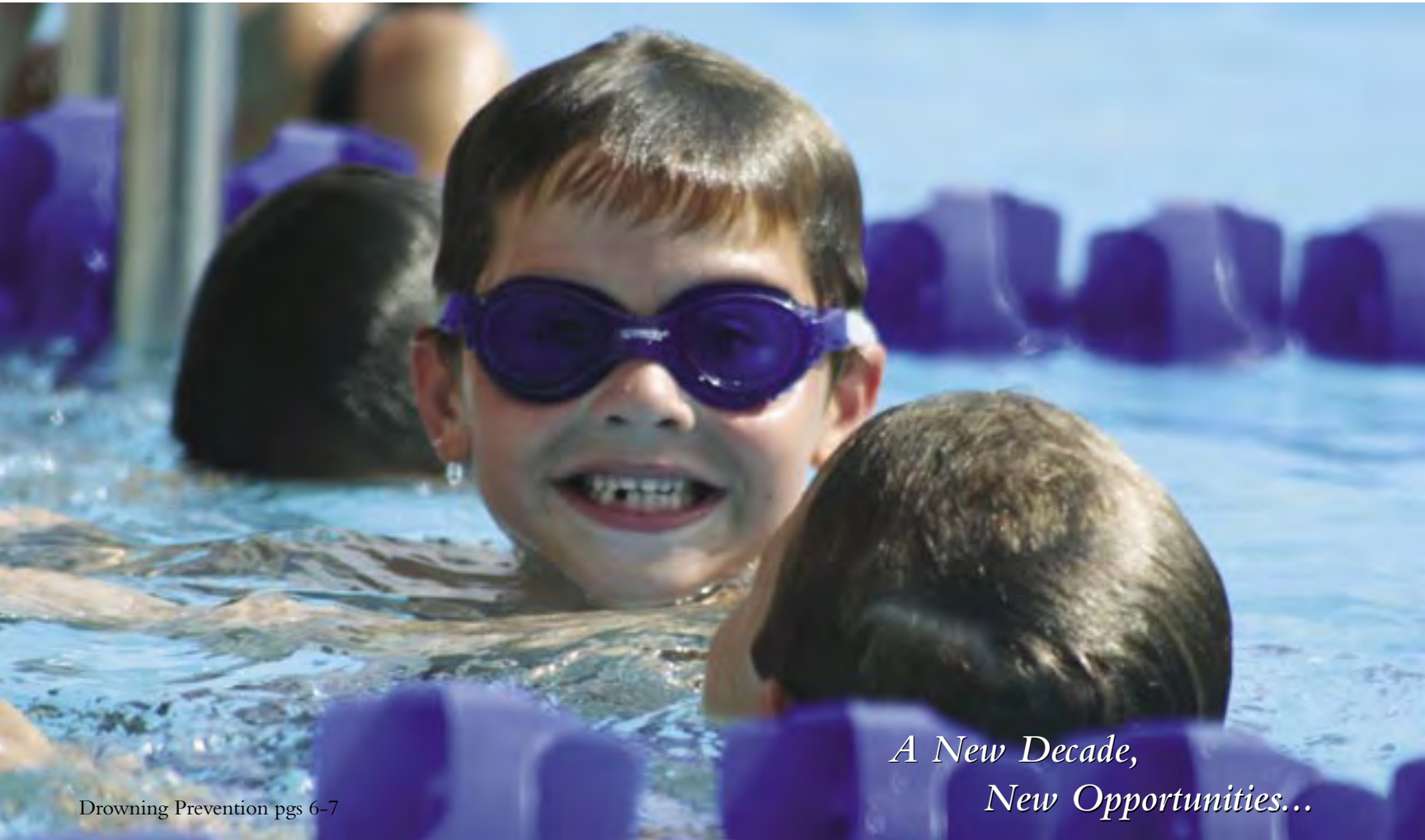
Drowning Prevention pgs 6-7