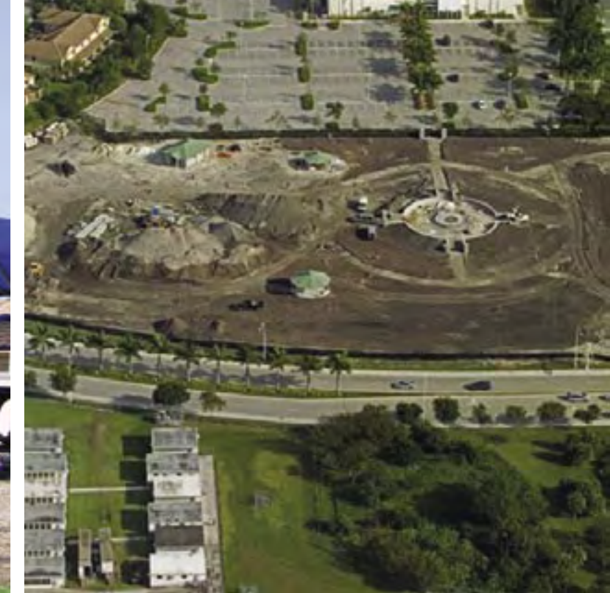
Library Park Construction