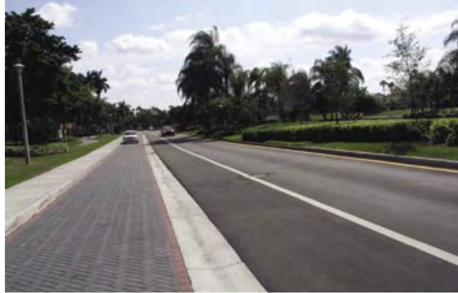
Country Isles Road at Country Isles Park. Now residents have easy access to additional parking.