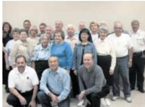
Graduation day for participants in the BSO Senior Citizen Academy.