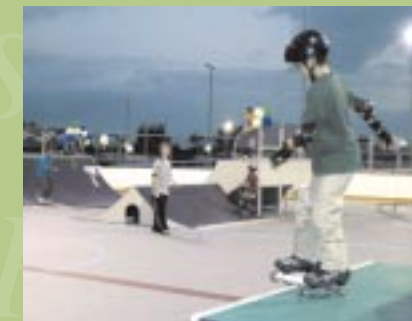
Jumps, ramps, inclines and grinds await in-line skaters and skateboarders!