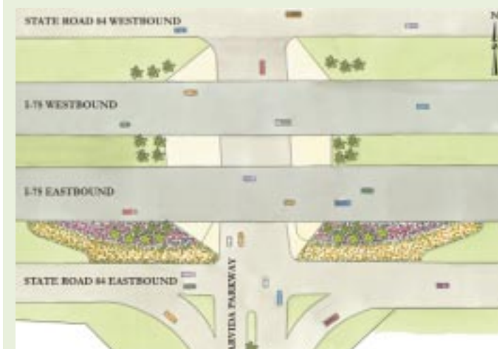
Arvida Parkway Interchange Rendering

Each interchange will receive identical landscaping improvements, which are depicted in the rendering showing the Arvida Parkway location. Approximately 40,000 square feet of land at each interchange will be transformed to provide visual impact and a City identity, as well as to enhance what is considered the gateway into Broward County from the West. The enhancements will utilize the "Paths of Sunshine" color palette, established for the County, through the selection of yellow, orange and red flowering plant materials.