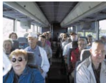
The 55+ Club ventures to Shark Valley.

The 55+ Club , based out of the Weston Community Center, is open to all senior citizens looking to be involved in the City's recreational social programming or just wanting to participate in an activity and have a great time with others.