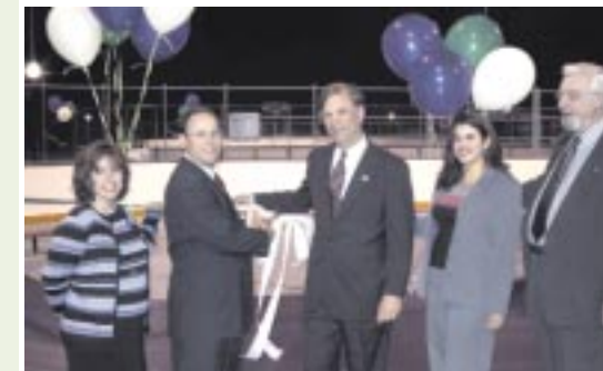
The Weston City Commission cuts the ribbon to fun and excitement at the Weston Skate Park