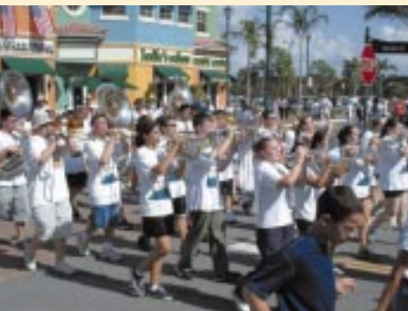
Stepping out to assist the hungry, the 2002 Weston CROPWALK.