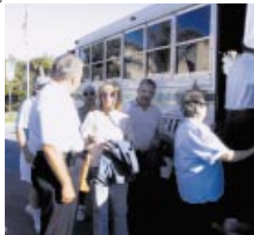
Senior Citizen Academy Class No. 5 boarding the BSO bus bound for downtown, to tour the BSO Crime Lab and 911 dispatch facility.

improving the quality of service delivery through education; create an additional feedback system to affect police training programs; conduct basic police orientation to inform citizens on matters that directly impact their community; and to leave students with an informed vision of the Broward Sheriff's Office, the nature of policing and the professionalism of employees. Additional Senior Citizen Academy's will be held in the future so call today to register, 954-389-2010 or 954-321-5076.