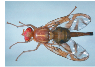
Jack Kelly Clark

Exotic fruit flies are considered some of the most serious of the world's agricultural pests due to their potential economic harm and threat to our food supply. They attack hundreds of different fruits, vegetables and nuts, including oranges, grapefruit, lemons, apples, guava, mango, tomatoes and peppers.