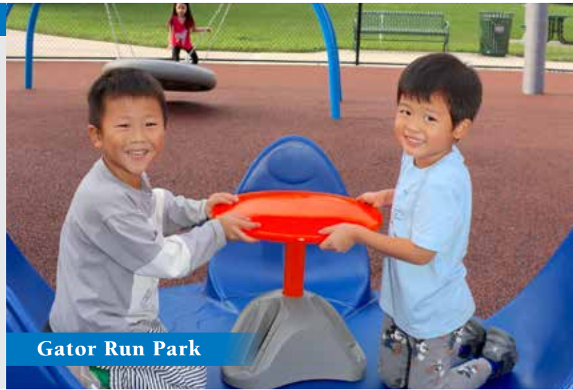
Gator Run Park